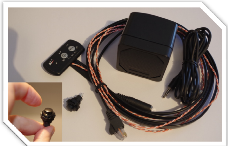
Photo 1. ALP Control Set PLUS

Intended for motorcycle users who need to hide Control set, and who need only audio plug for connecting with wireless 3rd party headphones and headsets in order to hear alerts inside a helmet.