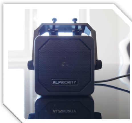
Photo 3. External ALP Speaker

NOTE: Options above do not provide VOICE alerts, but regular Control set alerts.